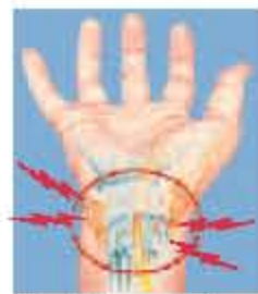
Carpal tunnel syndrome

Both the National Institute for Occupational Safety and Health and Health Construction Safety Association of Ontario reports state the MAX Re-bar Tying Tool reduces the risk of Carpal Tunnel Syndrome and other work related musculoskeletal disorders.